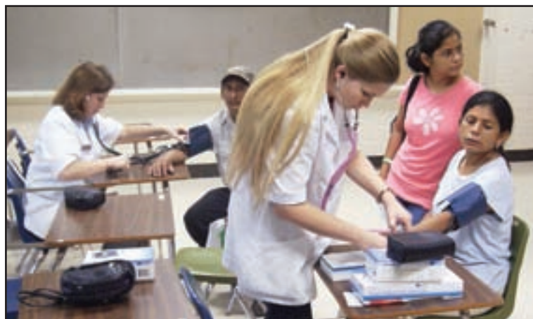
Community members received free health screenings at the health fair held at Aldine Senior High School.

During the 2008-09 school year, Aldine Senior High School hosted a community-wide health fair, sponsored by Texas Children's Hospital. More than 10,000 community members attended the fair, where they received health screenings, backpacks and immunizations. A number of businesses also participated in the event.