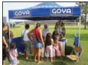
Health fair participants visit the Goya Food booth at the health fair.