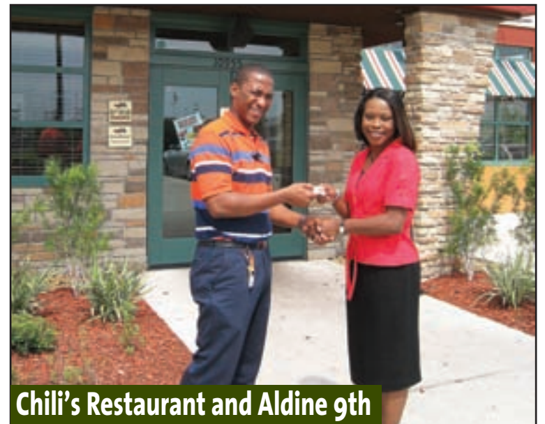
Chili's Restaurant and Aldine 9th